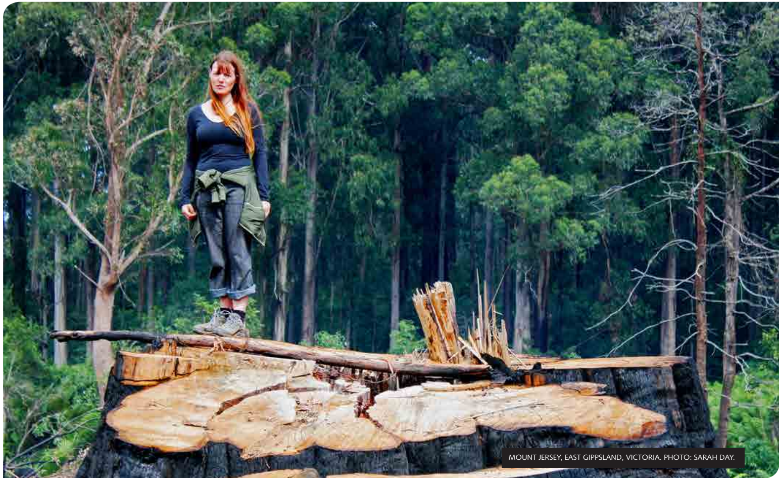
MOUNT JERSEY, EAST GIPPSLAND, VICTORIA.

Mouse. However, such amendments are relatively rare, and a cumbersome way of providing for adaptive management.